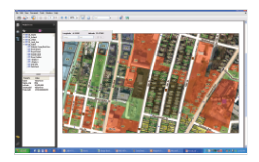
Share your maps as Geo registered PDF—Associate geographic location and tabular data to geography right in the PDF. Sharing maps as Geo registered PDF means sharing map insight.

New capabilities help users and organizations search for data within an organization or around the world. Metadata (think of this as "data about data") is easily collected and shared with industry-standard data catalogs available from PBBI or other vendors. This includes the Open Geospatial Consortium's (OGC) Catalog Services WEB (CSW) standard which is required for meeting INSPIRE data sharing requirements. One or more catalogs can be searched at a time to find data that you need. These data catalogs might reference an organization's own internal data or they could be catalogs of data offered by other organizations that are on the Internet. Users will also be able to do some light editing on a single table. Another powerful capability is the ability to instantly view the actual data in MapInfo Professional. Viewing the data in MapInfo Professional is available when data is